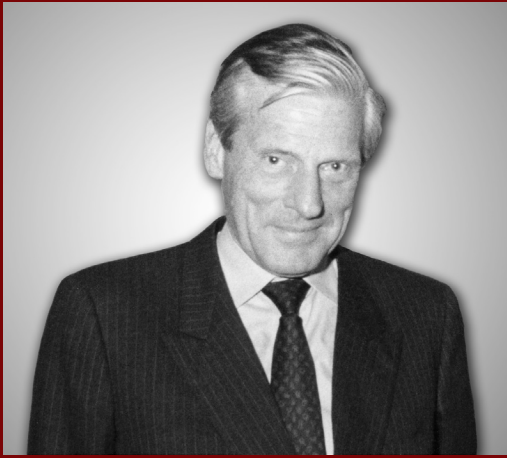
Dr. Walther Leisler Kiep