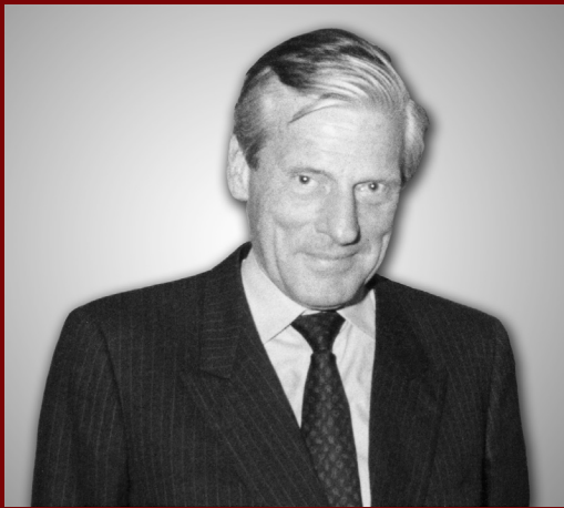
Dr. Walther Leisler Kiep